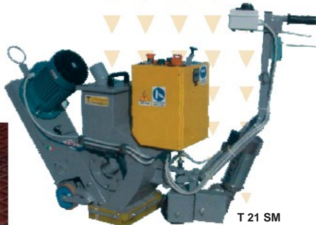
T 21 SM