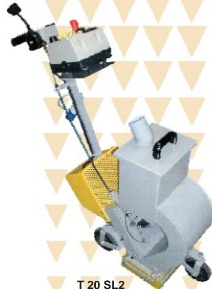
T 20 SL2